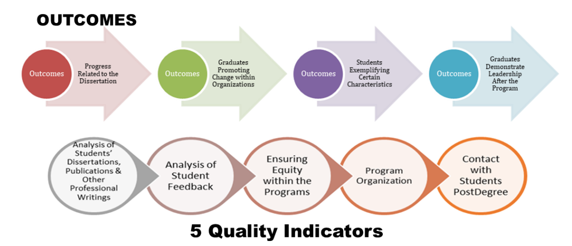
Figure 3. CPED-Informed Framework for the Ed.D. Activist