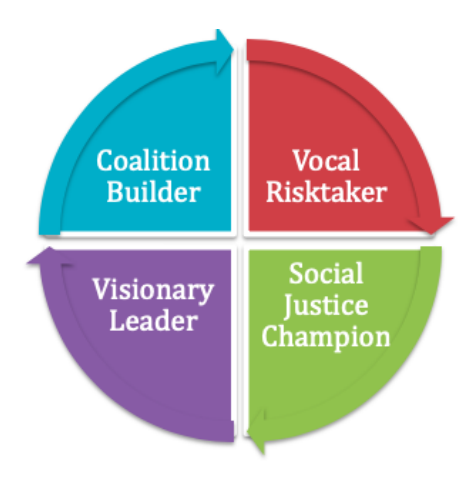
Figure 1. The Single Profile Model

The Profile of an Ed.D. Activist will likely vary from program to program. Among the researchers engaged in this study, a lively debate about whether we have uncovered a single profile or multiple profiles impressed upon us the importance of recognizing our conceptualization may differ significantly from faculty in other programs. If so, the implications of this emerging profile likewise differ. With this in mind, we decided to share both a single-profile model of a multi-faceted Ed.D. Activist and a multi-profile model proposing four distinct kinds of Ed.D. Activists