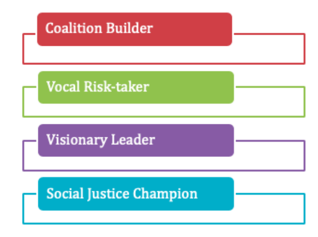
Figure 2. The Multi-Profile Model

Based on the themes uncovered by Prompt 1, this model incorporates all four themes into one, cohesive profile. This tentative model suggests that each graduate of an Ed.D. program may embody all four aspects but to varying degrees. For example, one graduate might see themselves as a skilled coalition builder but a bit reluctant to take large risks. Another graduate might feel a deep sense of commitment to others and thus be motivated to contribute to the work of rectifying issues of social justice yet remain somewhat hesitant to take on a leadership role. In other words, each graduate will demonstrate the four aspects to varying degrees based on their unique abilities. Programs that desire to have graduates embody this comprehensive model of an Ed.D. Activist should think critically and strategically about how their Ed.D. program will provide the necessary foundation for students to emerge with the complete skill set representative of this model.