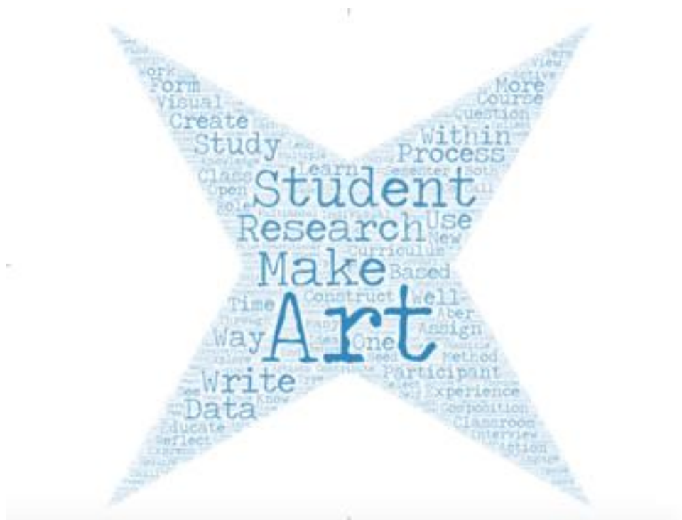
Figure 2. Research Prospectus Word Art