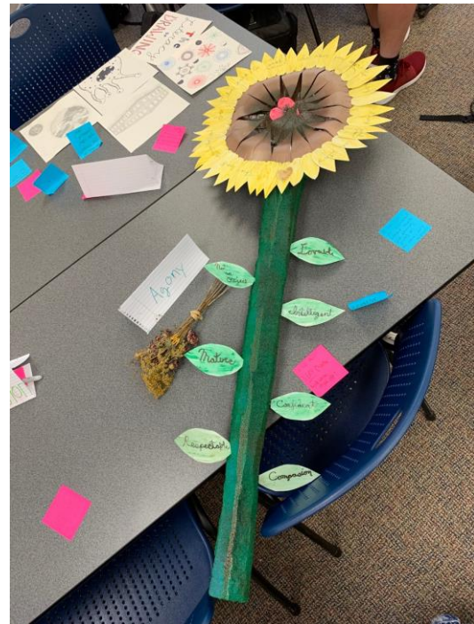
Figure 3. Mile's Literacy Narrative