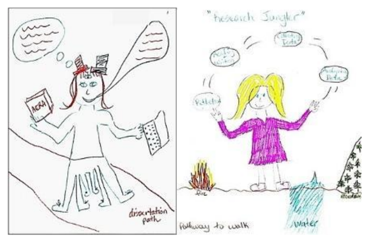
Figure 1. Diane's pre- and post- drawings for the Draw-a-Researcher Test

After examining her pre- and post- drawings (see Figure 1), Diana expressed: