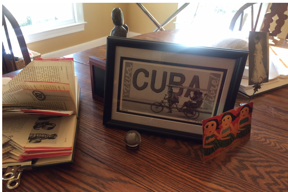
Figure 1. Examples of Still Life Photographs

To prepare, the instructor creates a still life scene as described above; then, the instructor takes a set of photographs of the scene in a 360-degree fashion. Each photo represents a sliced view of the still life, mimicking the face-to-face individual views. See Figure 1 for example photographs from Phillips; these are four of eleven total photos in the set, roughly representing the still life at 90-degree angles.